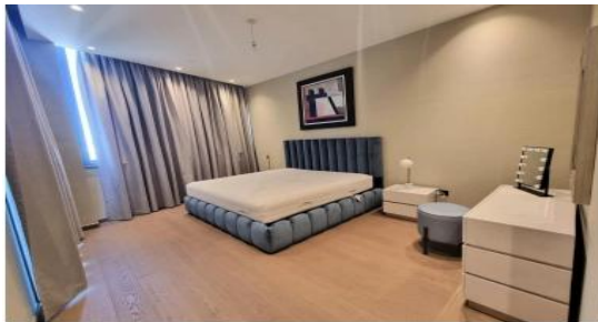
MASTER EN-SUITE BEDROOM