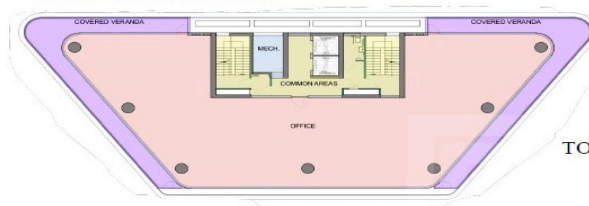
ROOF GARDEN AREA