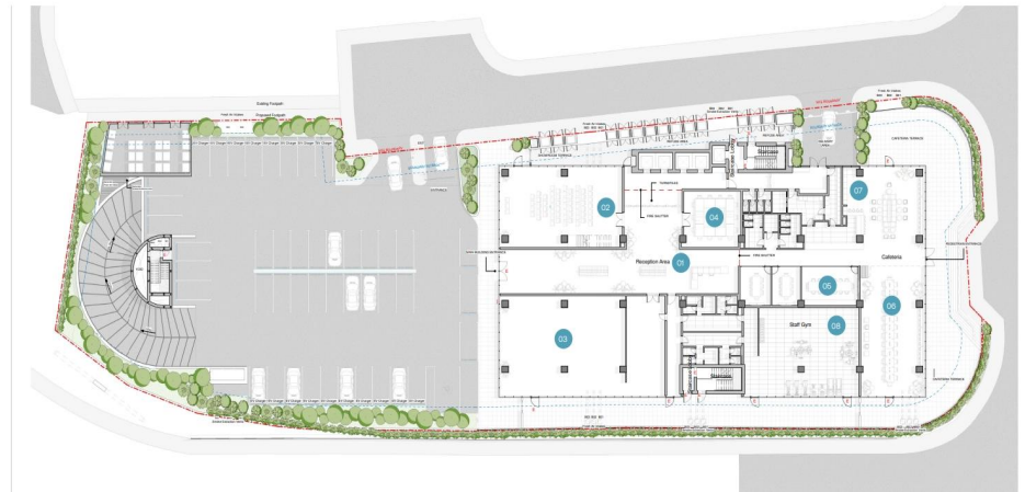
Typical Full Floor