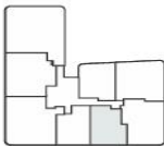
Floorplan location – level 01-03