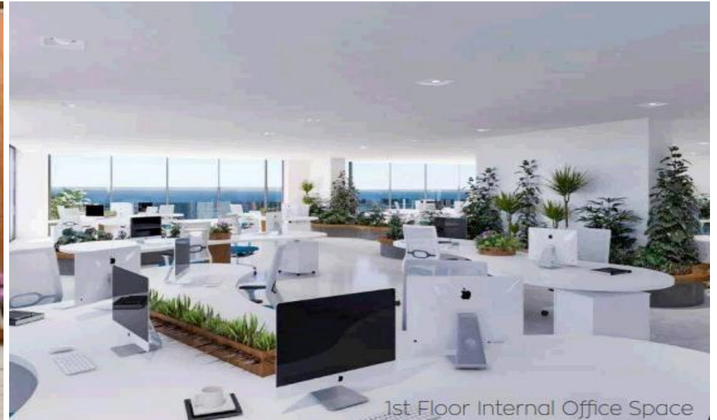
1st Floor Internal Office Space