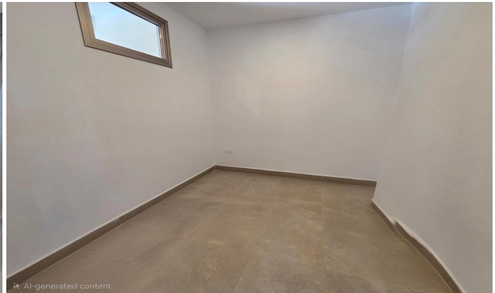
✦ AI-generated content