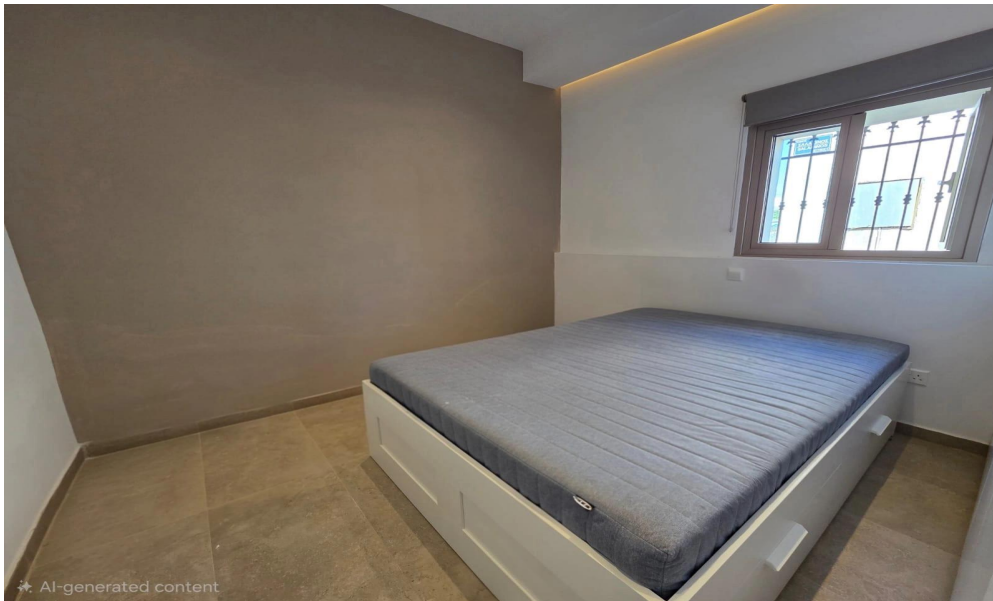
✦ AI-generated content