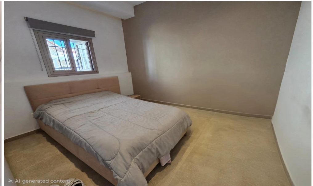
✦ AI-generated content