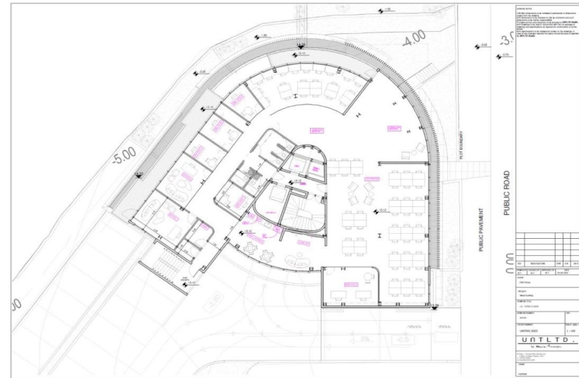
Level 4 Floor Plan