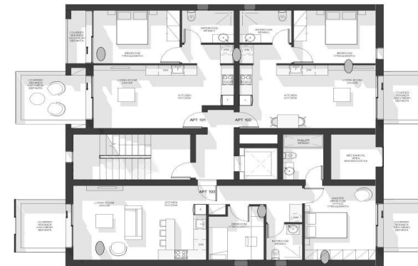
FIRST FLOOR ΠΡΩΤΟΣ ΟΡΟΦΟΣ ΚΛΙΜΑΚΑ 1:100