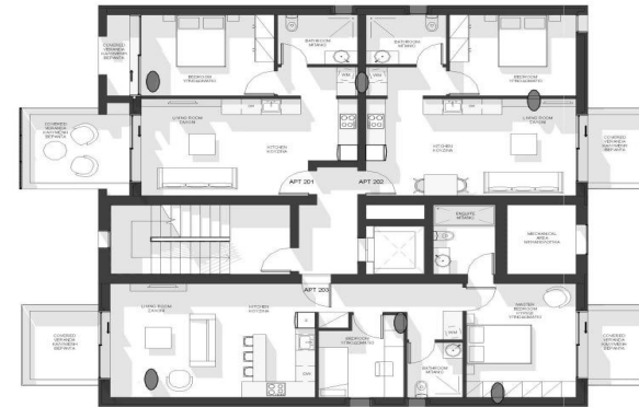
SECOND FLOOR ΔΕΥΤΕΡΟΣ ΟΡΟΦΟΣ ΚΑΙΜΑΚΑ 1:100