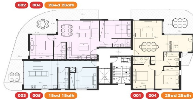
Apartment Floor Plans Floor 1 & 2