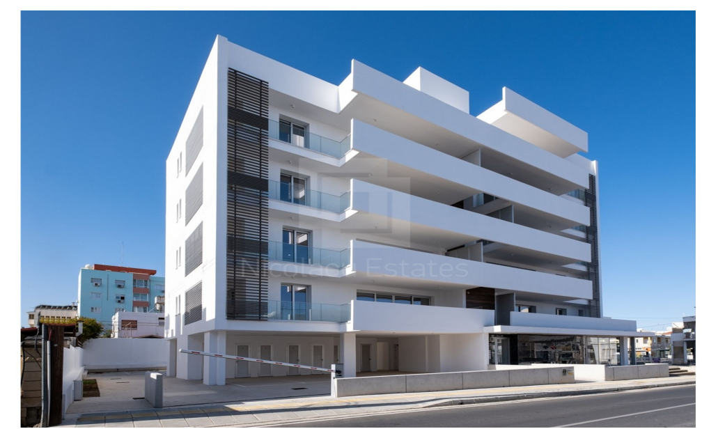
Sep 10, 2025