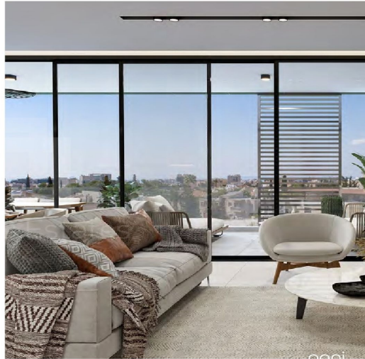
1st, 2nd & 3rd Floor