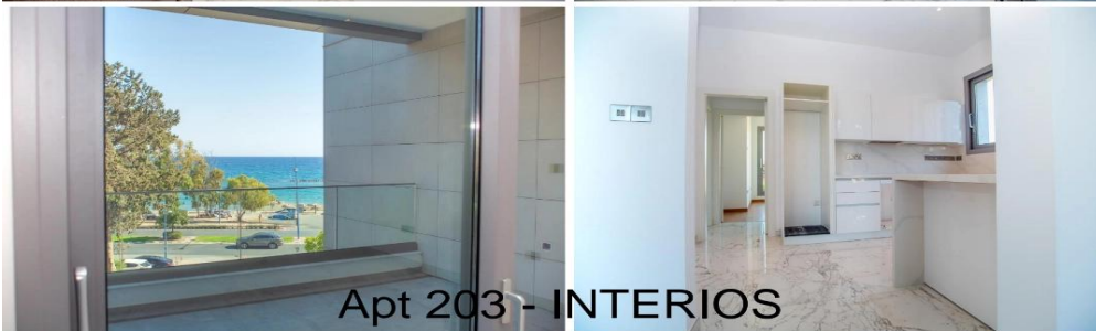
Apt 203 - INTERIOS