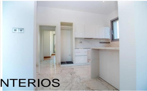
Apt 203 - INTERIOS