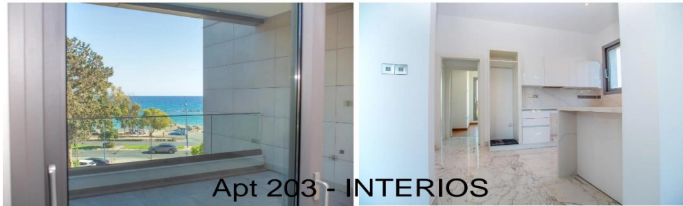
Apt 203 - INTERIOS