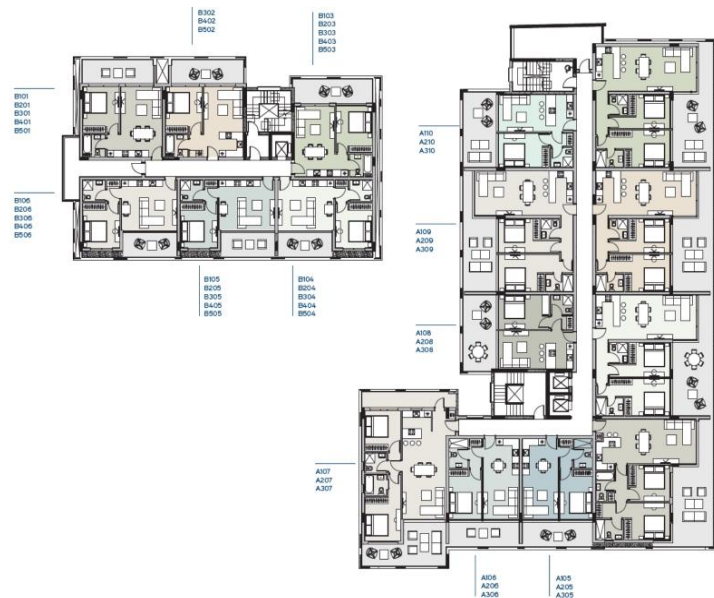
ЗДАНИЕ А ЭТАЖИ 1, 2, 3