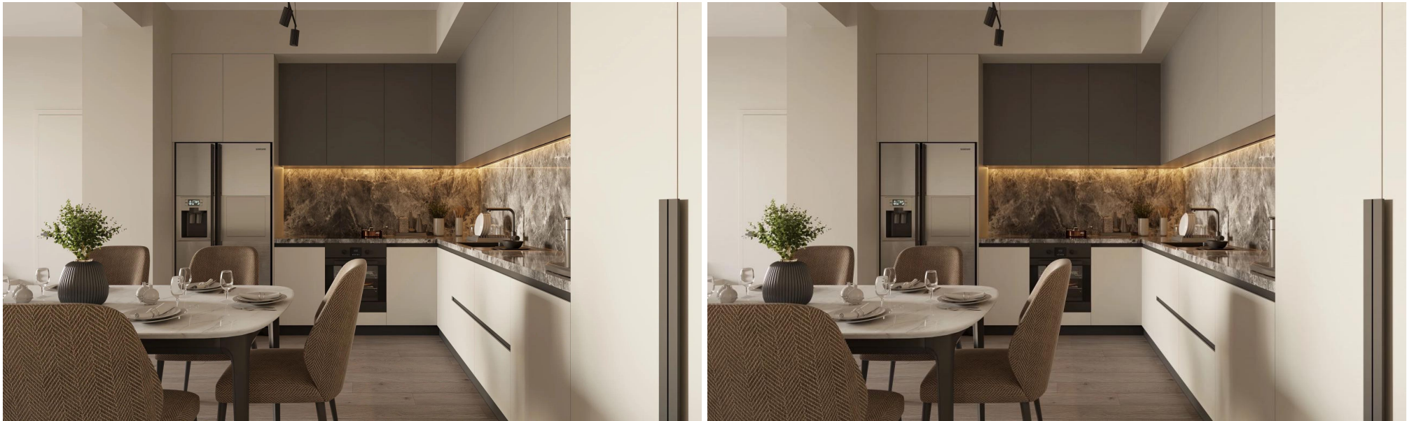
1ST - 3RD FLOOR