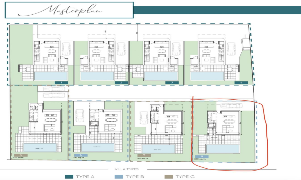
VILLA TYPES ■ TYPE A ■ TYPE B ■ TYPE C