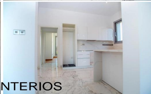
Apt 203 - INTERIOS