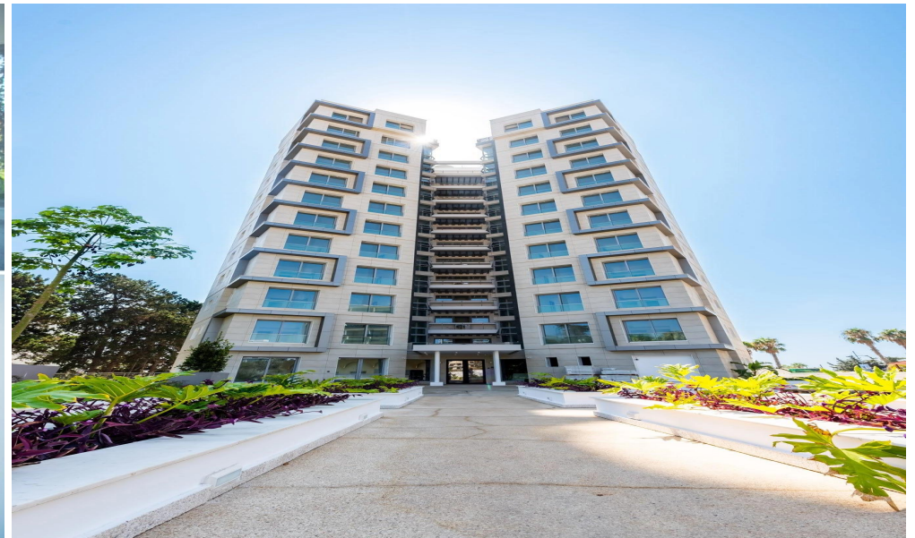
Apt 203 - INTERIOS