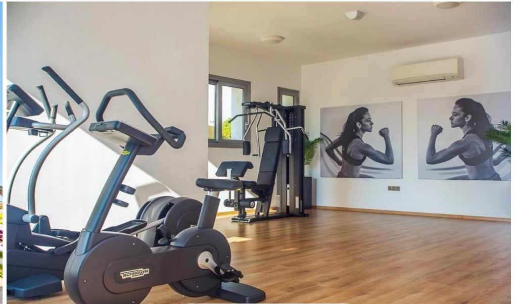
THE ADDRESS Second Floor - Apt 203