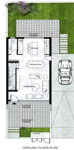
VILLA TYPE A1 - PLOTS V5,V6,V7,V11,V12