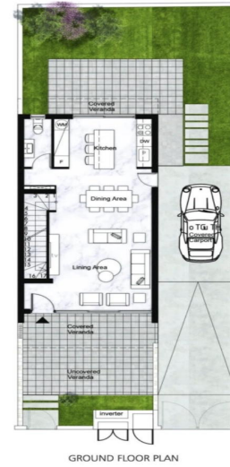
VILLA TYPE A1 - PLOTS V5,V6,V7,V11,V12