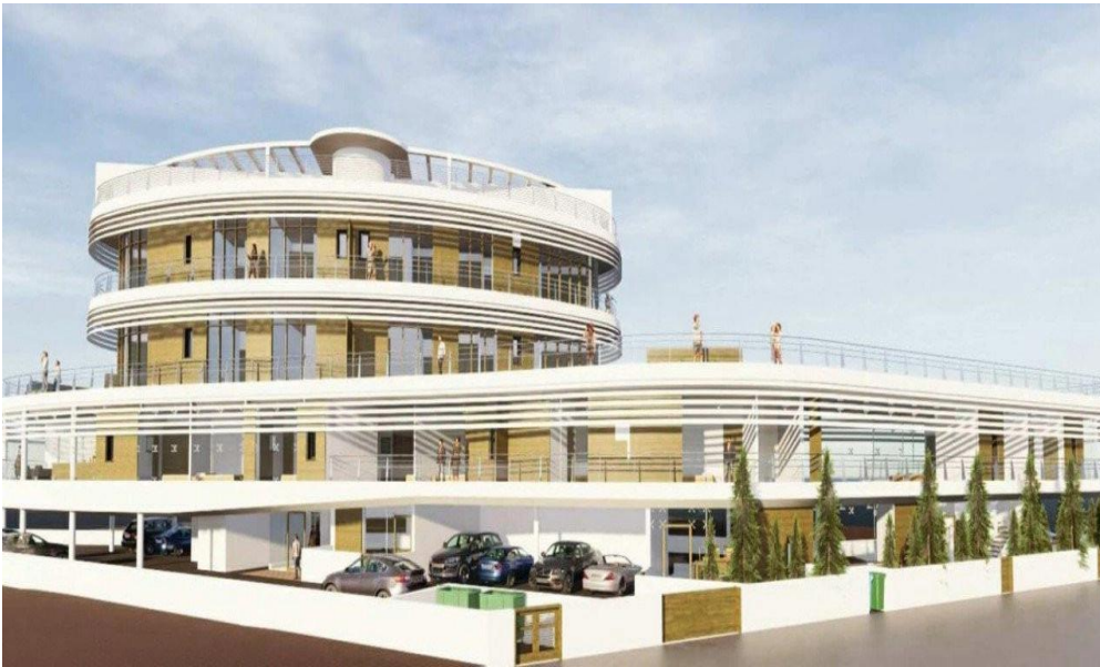
3 BEDROOM MAISONETTE