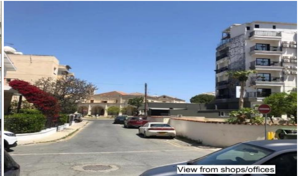
View from shops/offices