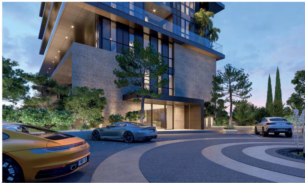
LEVELS 3 rd & 14 th Executive Garden Apartments