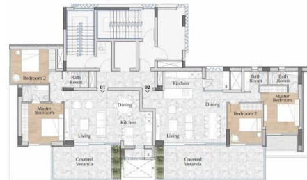
1 st & 3 rd Typical Floor