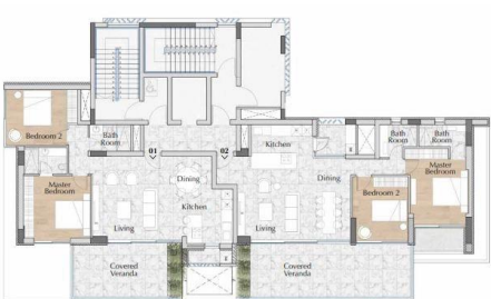
2 nd & 4 th Typical Floor