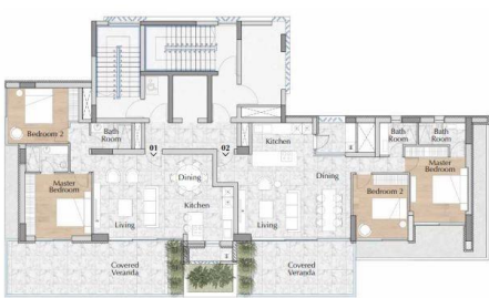
1 st & 3 rd Typical Floor