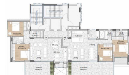
2 nd & 4 th Typical Floor