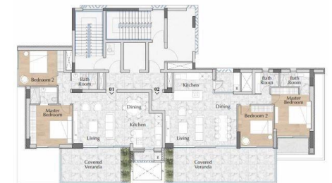
2 nd & 4 th Typical Floor