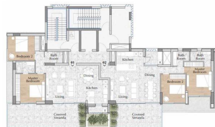
1 st & 3 rd Typical Floor