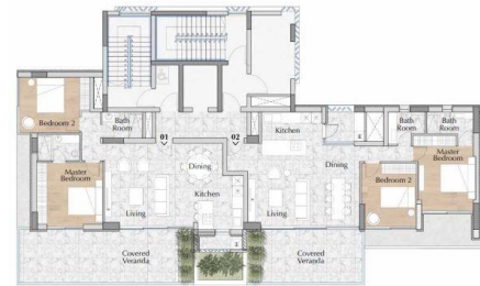
1 st & 3 rd Typical Floor