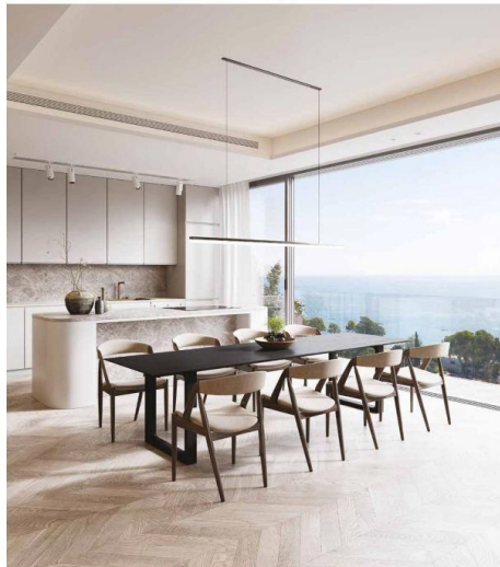
Each apartment blends elegant functional design, high-end interiors, and an ambient lighting that feel both timeless and refined. Innovative use of texture and form produce a compelling visual aesthetic, with floor-to-ceiling glass doors and windows and large private balconies that bring the outside in to create a feeling of abundant space and airiness.