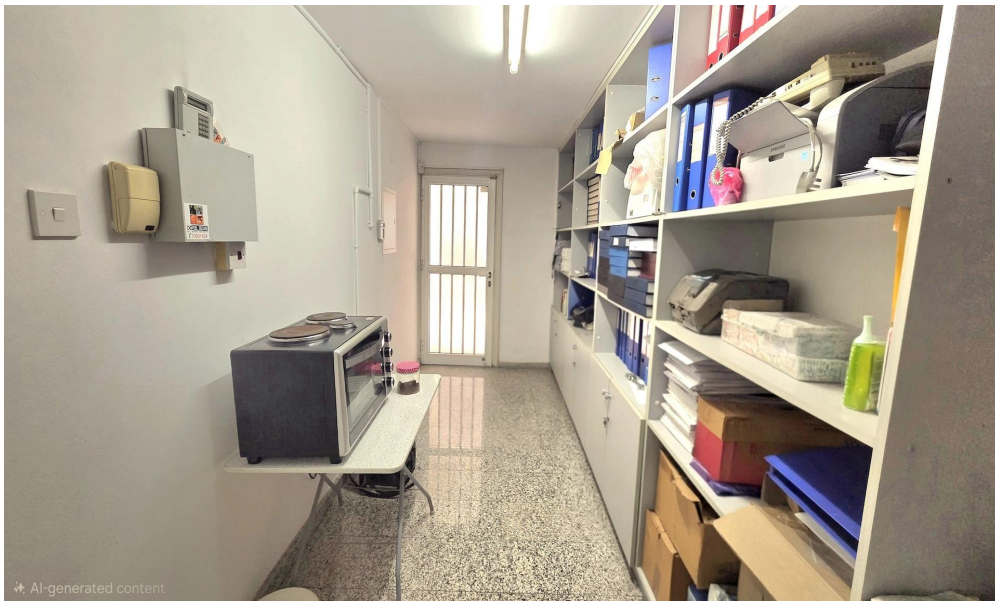
✦ AI-generated content