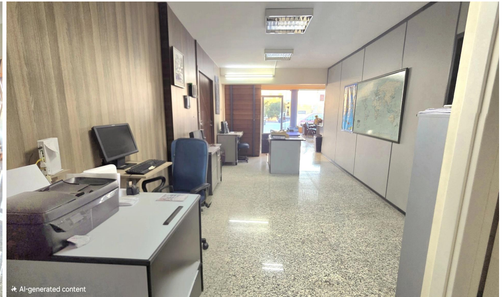
✦ AI-generated content