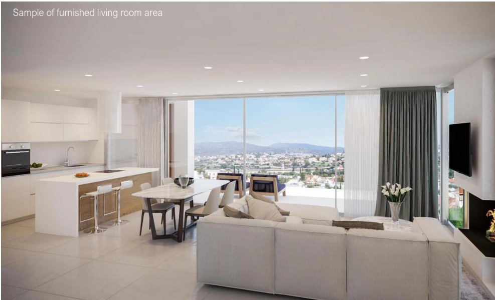
Sample of furnished living room area