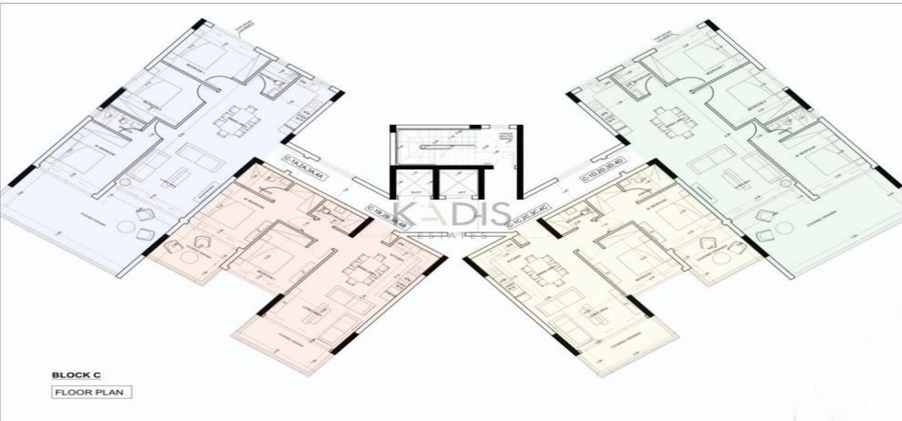
BLOCK C FLOOR PLAN