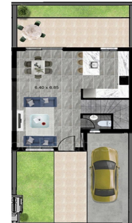
Block C - Unit # 32 Internal Area # 105 SQM Covered Veranda # 4 SQM Plot Area # 105 SQM