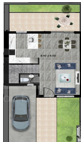
Block C - Unit # 33 Internal Area # 105 SQM Covered Veranda # 4 SQM Plot Area # 106 SQM