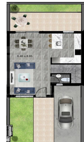
Block C - Unit # 34 Internal Area # 105 SQM Covered Veranda # 4 SQM Plot Area # 107 SQM