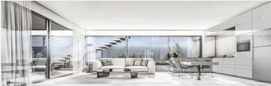
Apartment with roof terrace