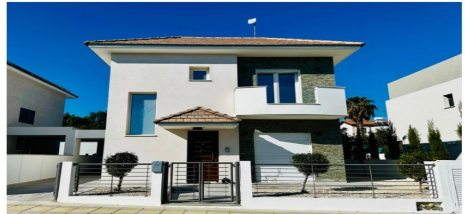
HOUSE TYPE A