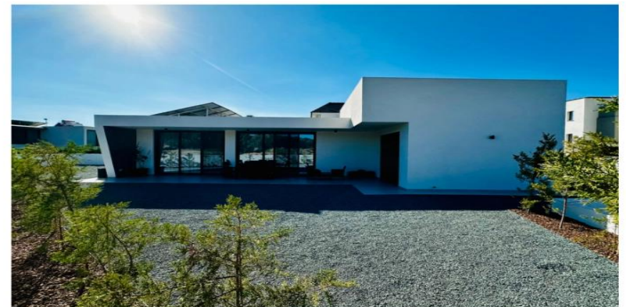
HOUSE TYPE C