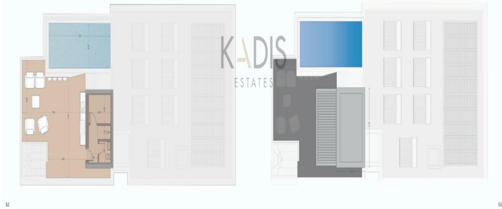
Roof Top Plan.