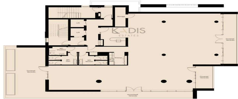
SECOND & THIRD FLOORS