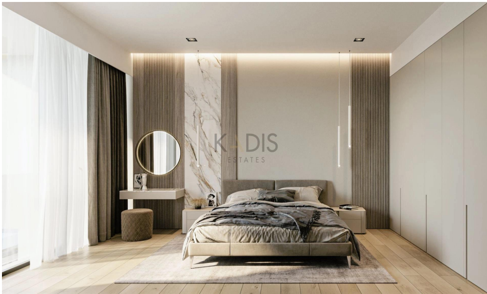
6 Townhouses PLOT 5 *