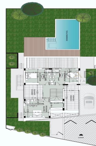
1 st Floor