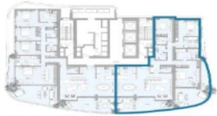
Preliminary Floor Plan