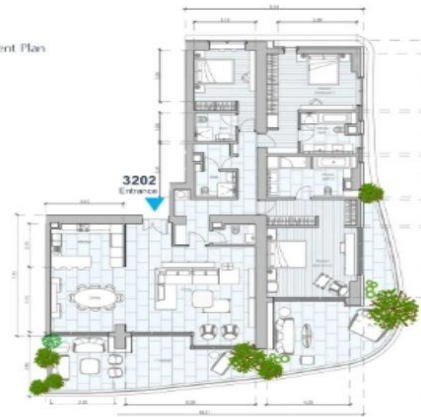
Preliminary Apartment Plan