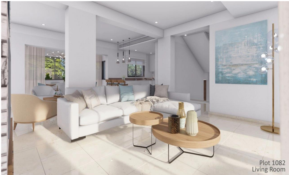
Plot 1082 Living Room