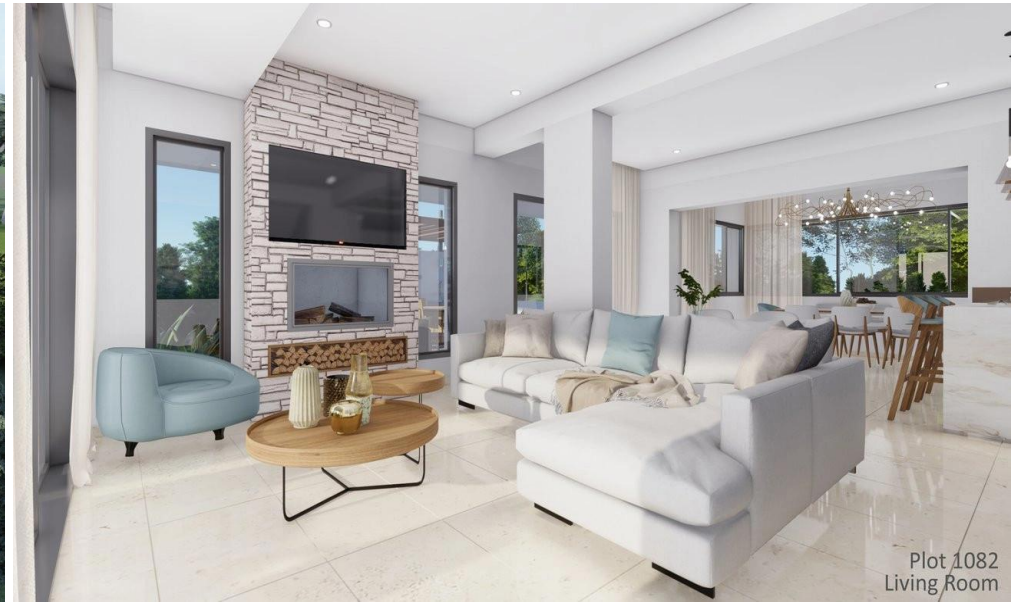
Plot 1082 Living Room