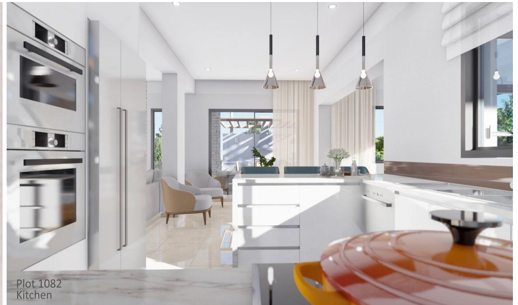
Plot 1082 Kitchen