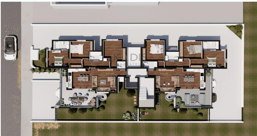
Κάτοψη 1ου ορόφου