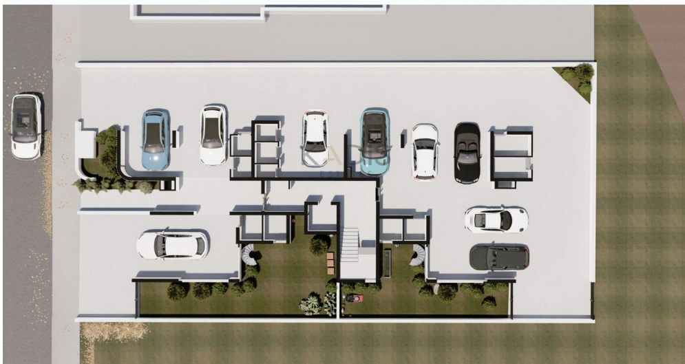
Κάτοψη 1ου ορόφου