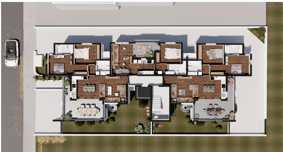
Κάτοψη 2ου ορόφου