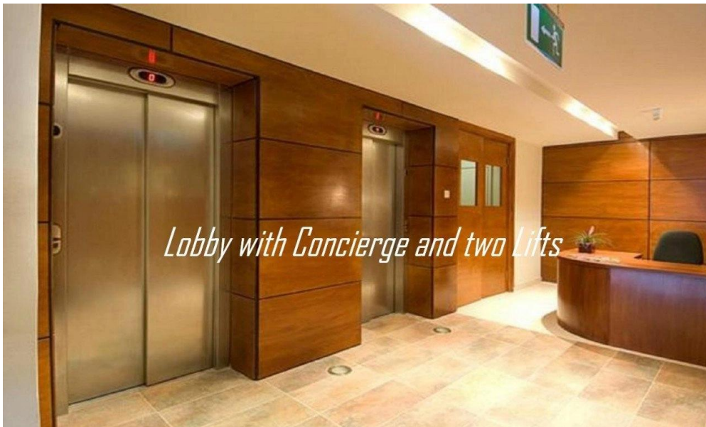
Lobby with Concierge and two Lifts