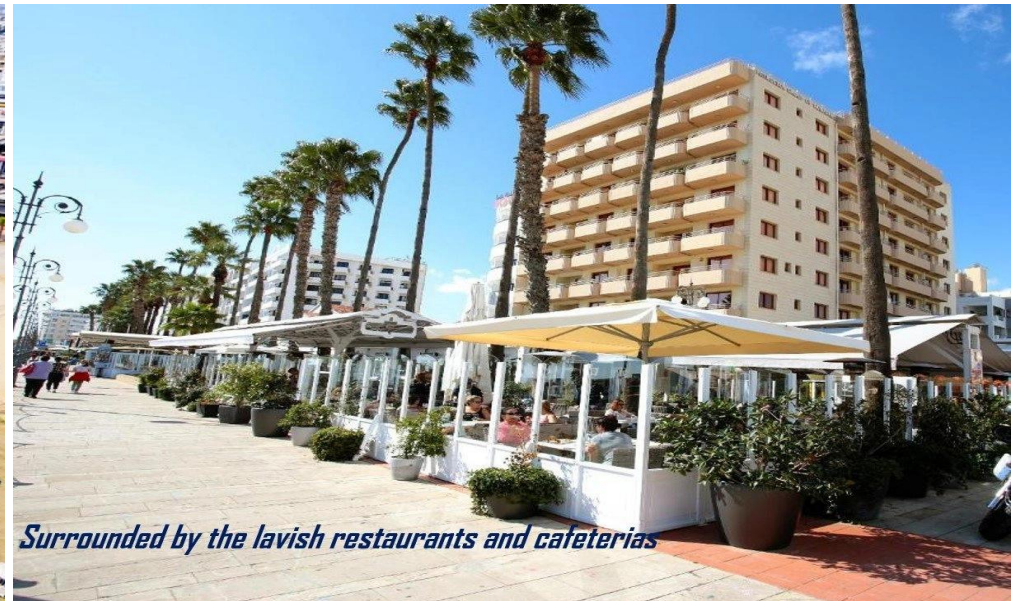
Surrounded by the lavish restaurants and cafeterias