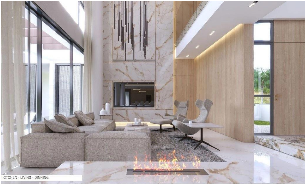
KITCHEN - LIVING - DINNING