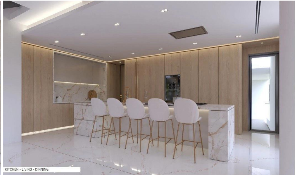
KITCHEN - LIVING - DINNING