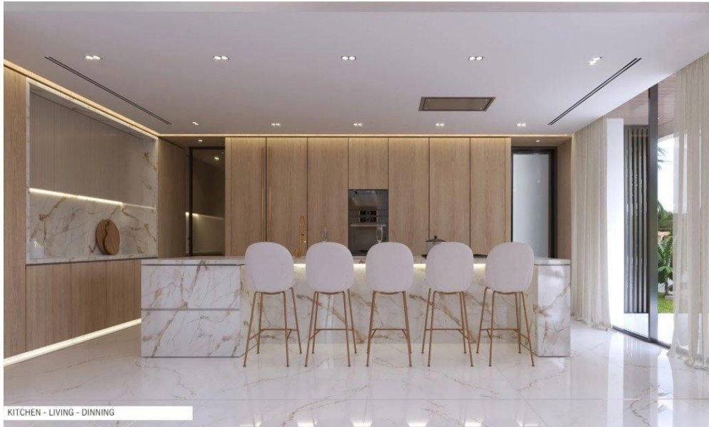
KITCHEN - LIVING - DINNING