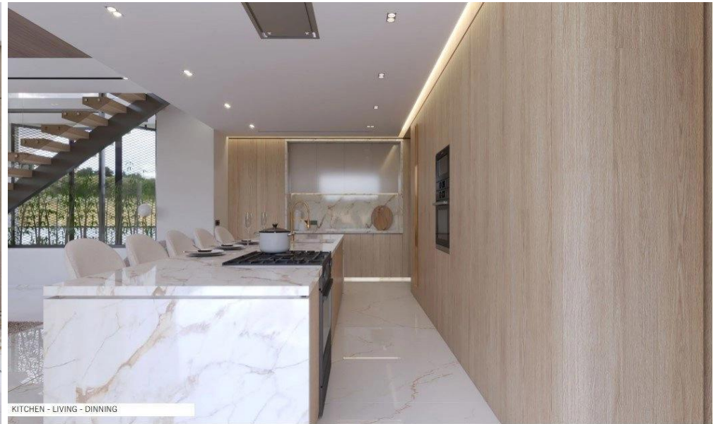
KITCHEN - LIVING - DINNING