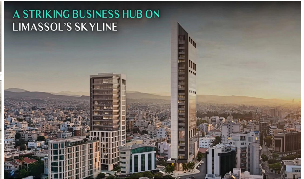
A STRIKING BUSINESS HUB ON LIMASSOL'S SKYLINE