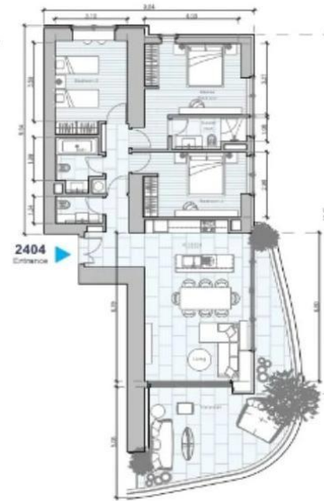
Preliminary Apartment Plan