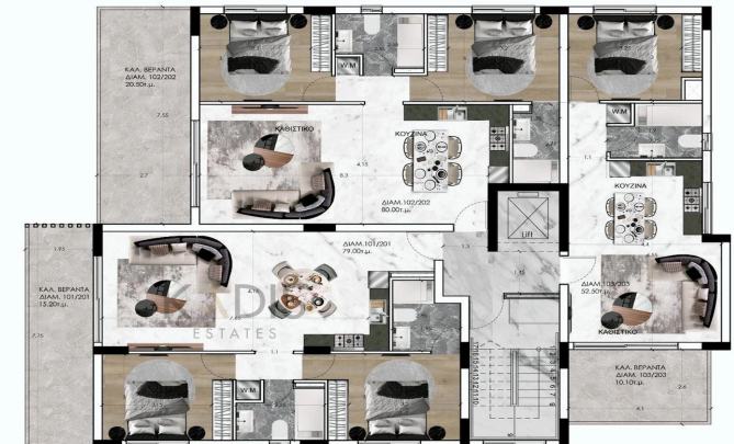
ΚΑΤΩΦΗ 1ου - 2ου ΟΡΟΦΟΥ / 1st-2nd FLOOR PLAN