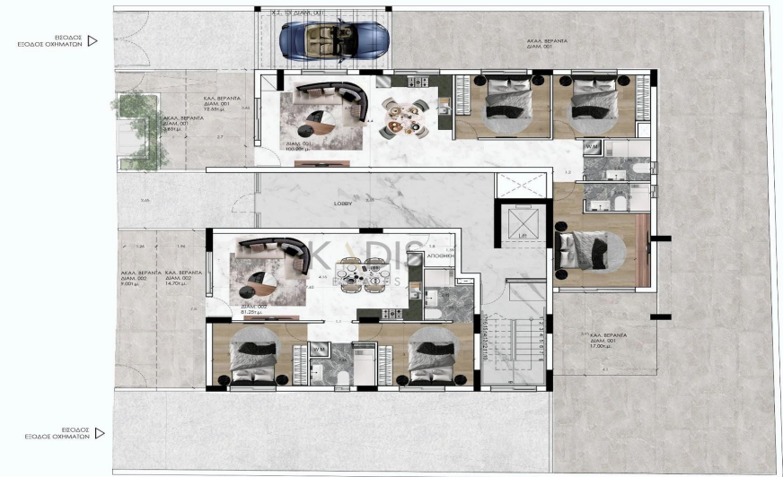
ΚΑΤΩΦΗ ΙΣΟΓΕΙΟΥ / GROUND FLOOR