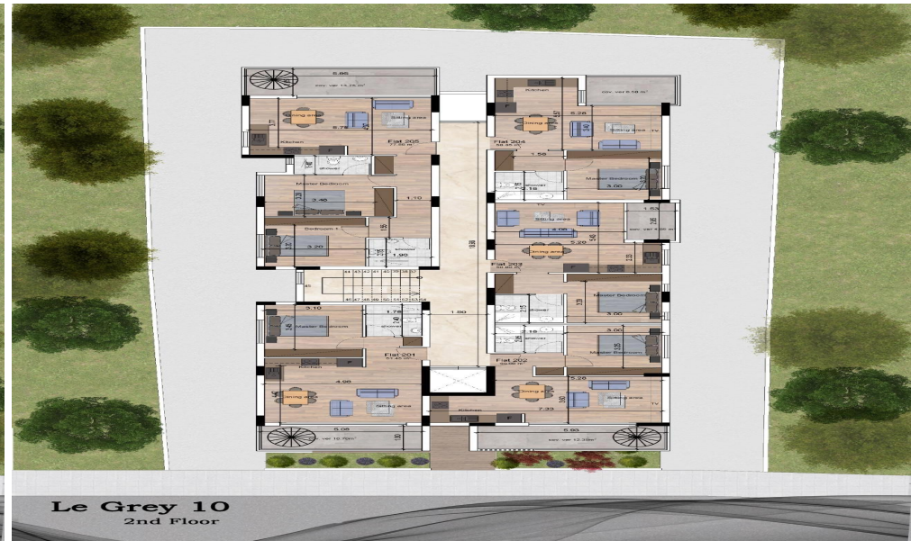
Le Grey 10 2nd Floor