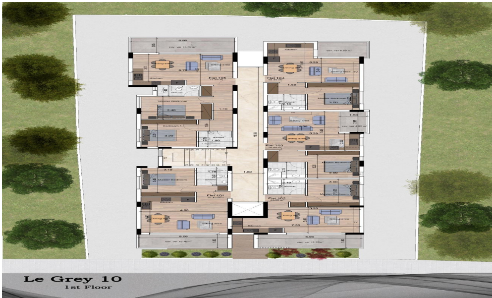
Le Grey 10 1st Floor