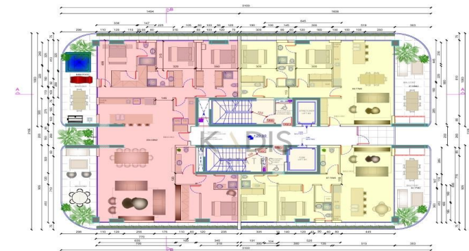
8th - 9th FLOOR