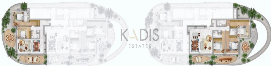
Seaview apartment with private garden