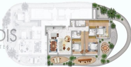
Seaview apartment with private garden