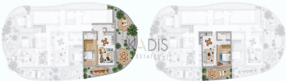
Seaview apartment with private garden