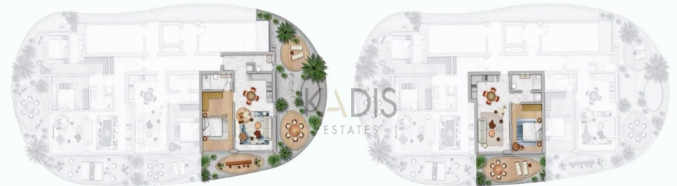
Seaview apartment with private garden