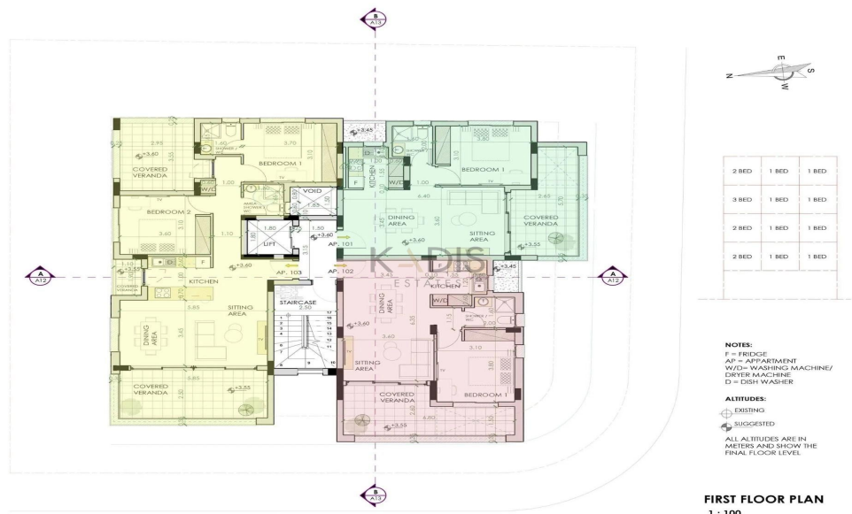
FIRST FLOOR PLAN 1 : 100