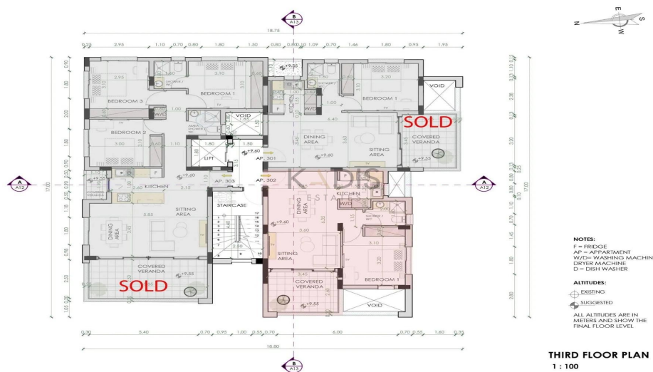
THIRD FLOOR PLAN 1 : 100