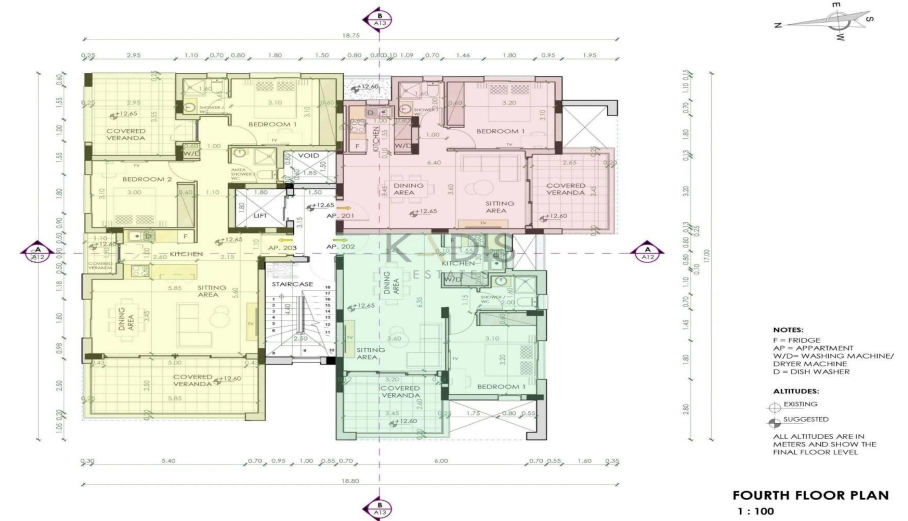
FOURTH FLOOR PLAN 1 : 100