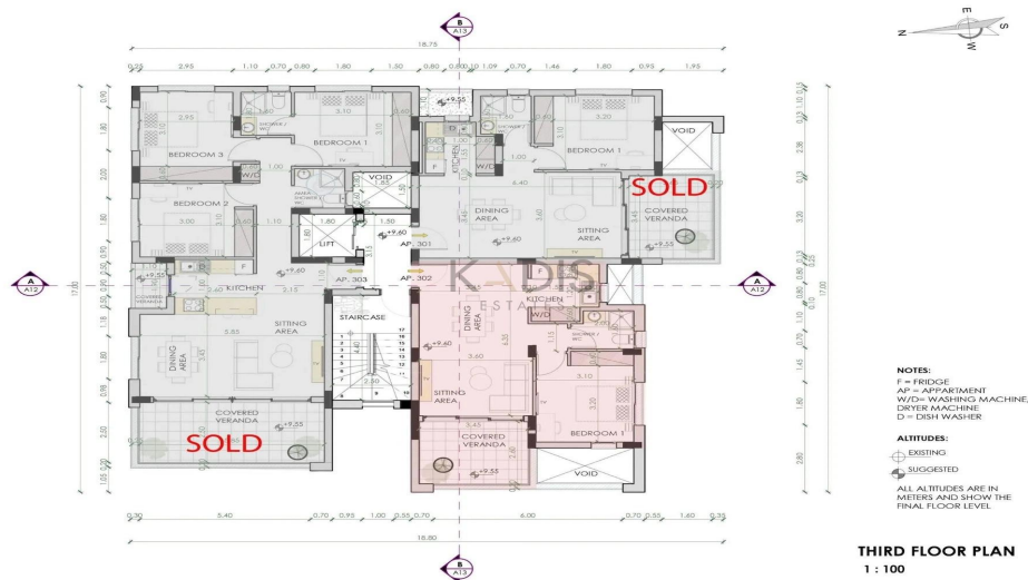
THIRD FLOOR PLAN 1 : 100