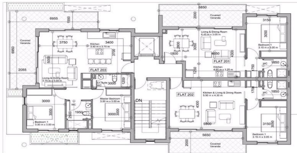
Drawings - 3 rd Floor